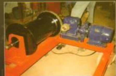
ABCO Power Winch