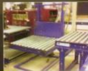
ABCO Pneumatic Lifts →