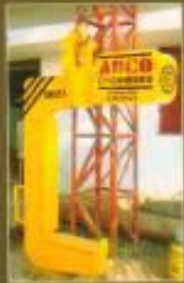
ABCO 'C' Hook