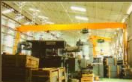
← ABCO Gantry Crane

Gantry Cranes offer an economical solution to bridge cranes when the building is inadequate to support a bridge crane or the crane system is to be located outdoors.