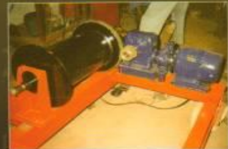
ABCO Power Winch