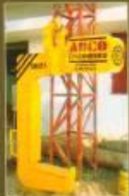
ABCO 'C' Hook