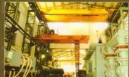
ABCO Semi Gantry Crane →